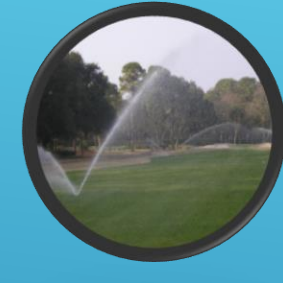
Recycled Water Distribution