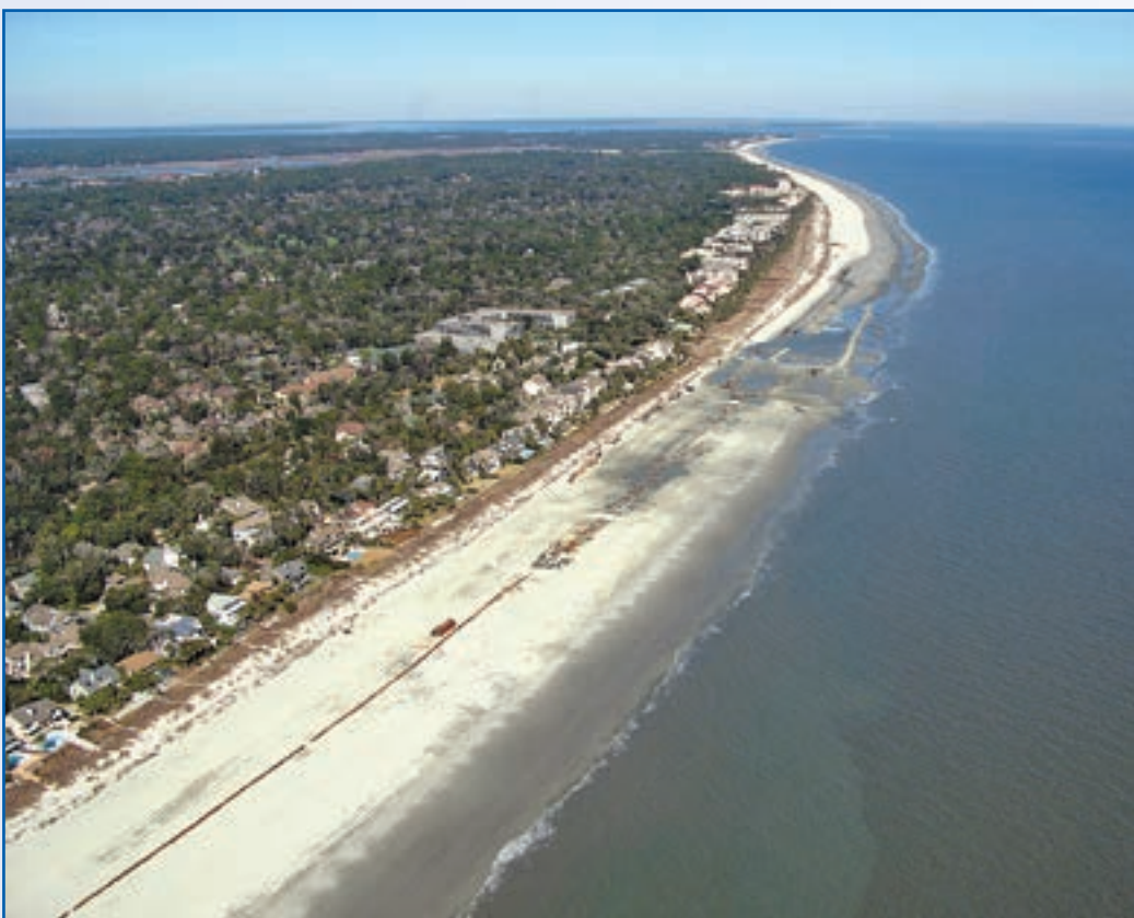
Photo from 2006 Beach Renourishment Project showing the 1,000 feet of restricted area, in addition to the remaining open beach.