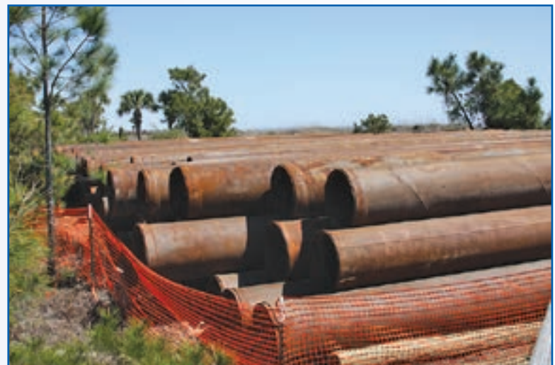
Beach Renourishment pipeline has arrived and is being stored at Islanders Beach Park.