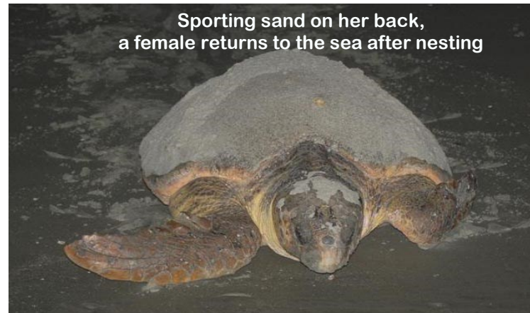
Sporting sand on her back, a female returns to the sea after nesting

The loggerhead has a massive skull and a body weighing 250-400 pounds and reaching up to 4 feet long! Like all sea turtles, loggerheads have front and rear paddle-like flippers that provide propulsion through the ocean. The upper shell of the loggerhead, called the carapace, is usually a reddish brown color, and the lower shell, called the plastron, is dull brown to yellow. The two shells are composed of horny plates called scutes.